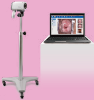
C3A/C6A Video Colposcope